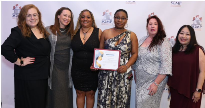
SGMPAZ AT THE 2025 SGMP NEC